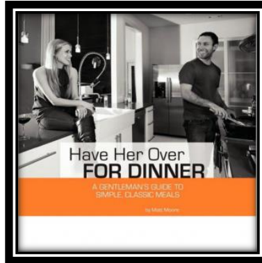
Have Her Over For Dinner